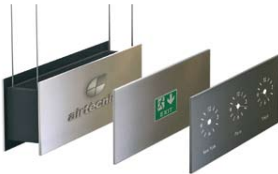
Example of customized front panels, to meet client needs