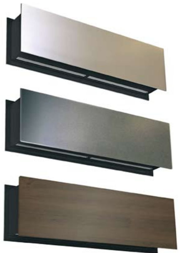
Different colours and materials finishes