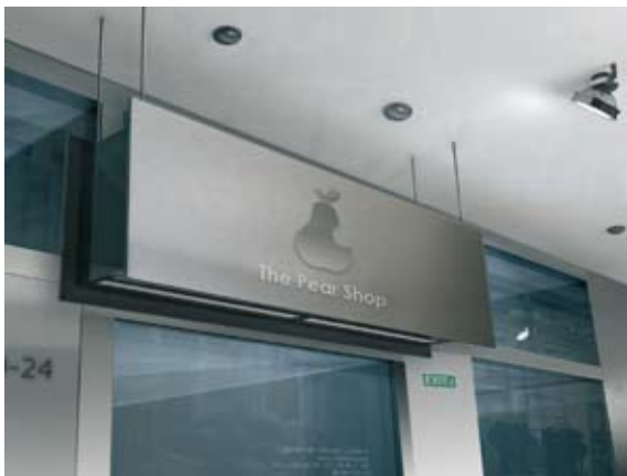
Example of suspended installation with rods or cables ZEN M 1500 E with fancy corporate logo